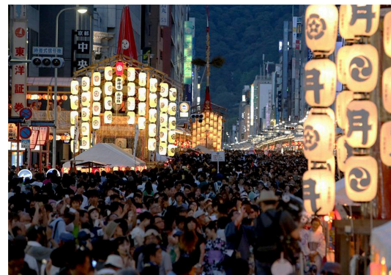
Gion Matsuri, the festival of Yasaka Shrine, is the most famous festival in Japan and takes place over the entire month of July.

During my 8 weeks there my housemate and I went to a local Aikido合気道 Dojo near Fushimi Inari Shrine伏見稲荷神社 a dozen times and had great time talking to the people at the Dojo. The master was extremely friendly and talked to us about the philosophy of Aikido and its roots in Chinese Qi Gong. It was nice to have some work out every week and get some real cultural experience at the same time.